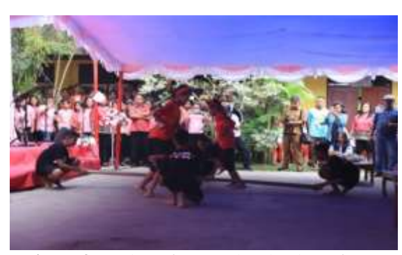
Figure 3. Students from Both Schools Perform Dances

The Pela Gandong relationship between the two schools has been built since 2013 by carrying out a number of joint activities including, sports and art week competitions, scouts, joint iftar, joint Christmas, joint student council activities to teacher exchanges to teach at the two schools. Thus, multicultural education that integrates local wisdom values such as Pela Gandong belonging to the Maluku people has been able to become a typical multicultural education model. In the field of government and politics, Pela Gandong's multicultural education has been included in the Ambon City Government's program in the Regional Medium-Term Development Plan (RPJMD) for 2011-2016 (Fikri & Hasudungan, 2021).