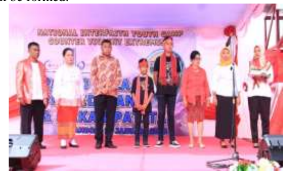
Figure 2. Both schools held Panas Pela of Education on January 29, 2018.

Multicultural education is a cross-border discourse that explores issues regarding social justice, deliberation, and human rights, political, moral, educational and religious issues (Tilaar, 2004). Tilaar further mentioned three sources to achieve a multicultural education curriculum, namely the concept of the needs of students, the concept of community needs, and the concept of the role and status of the subjects to be delivered. From these three concepts, the formulation of a multicultural education curriculum will be formed.